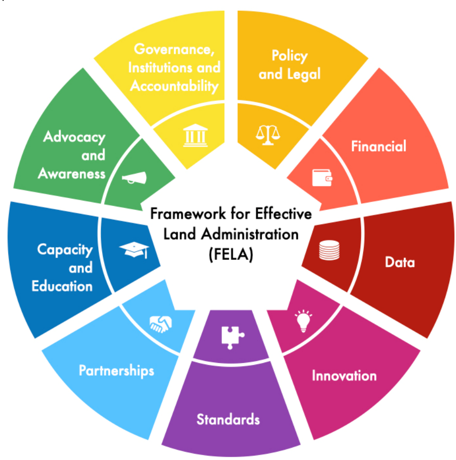
Figure 6: Nine Pathways of the Framework for Effective Land Administration

The nine strategic pathways of IGIF<sup>68</sup> guide FELA. The main areas of influence of the IGIF equally apply: people, governance, and technology. The strategic pathways are intended to guide the implementation of FELA, support the IGIF implementation more broadly, and ultimately achieve the SDGs and sustainable development. The nine FELA pathways are linked and overlap. For ease of communication in FELA, and like the IGIF, they are described independently. Linkages between the nine pathways are highlighted where appropriate.