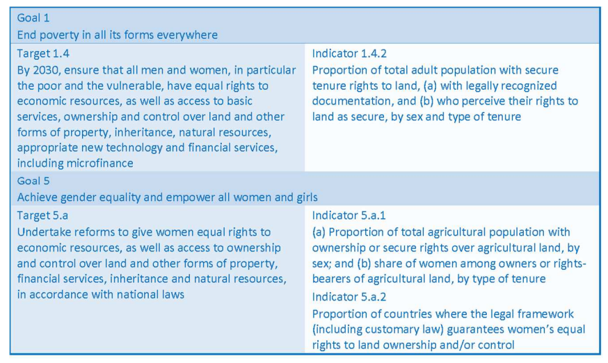
Figure 2: Examples of Goals, Targets and Indicators related to land

The SDGs are a call for action by all countries to promote prosperity while protecting the planet. They recognize that ending poverty must go hand-in-hand with strategies for economic growth, also address societal needs including education, health, social protection, and job creation, all within the frame of tackling climate change issues, biodiversity loss, and environmental protection. People to land relationships directly and indirectly influence all SDGs.